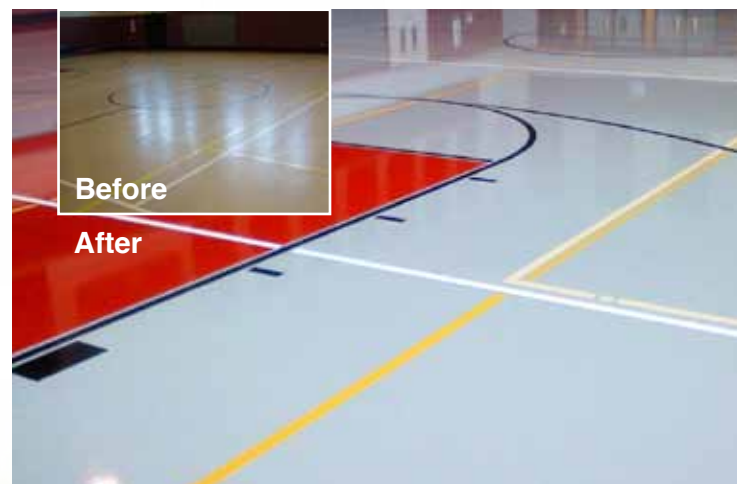
Graves Gymnasium, Poured Urethane Floor NeverStrip Colors; Grey, Yellow, White, Red and Black